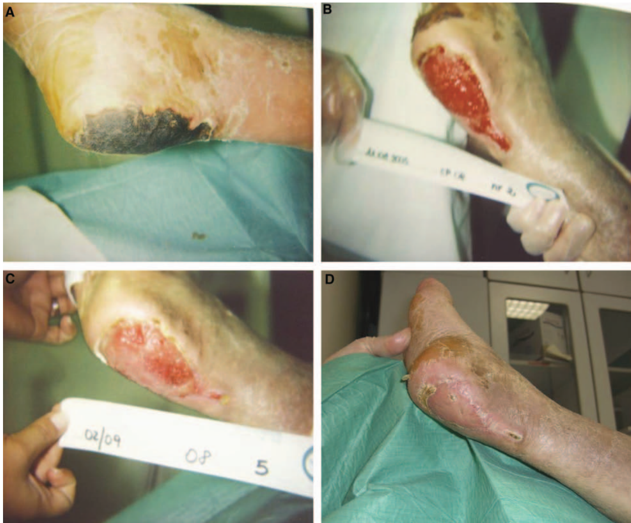
Fig. 2 A case managed with Dermacyn. A) a wide necrotic area in the Achilles tendon region caused by the presence of ischemia and infection induced by trauma from shoes. B) The patient after revascularization, surgical debridement, and 2 weeks of treatment with Dermacyn-saturated dressings. Granulation tissue is present over 100% of the lesion and completely covers the exposed tendon. C) The lesion after another month of treatment with Dermacyn-saturated dressings. A reduction of 25% of the lesion area is noticeable in addition to reduction of the perilesional inflammation signs. This lesion was then suitable for grafting. D) The lesion 3 weeks after the grafting procedure. Complete epithelialization has occurred.

was significantly higher in group A than in group B (87.5% vs 51.4%, P = .00827 ).